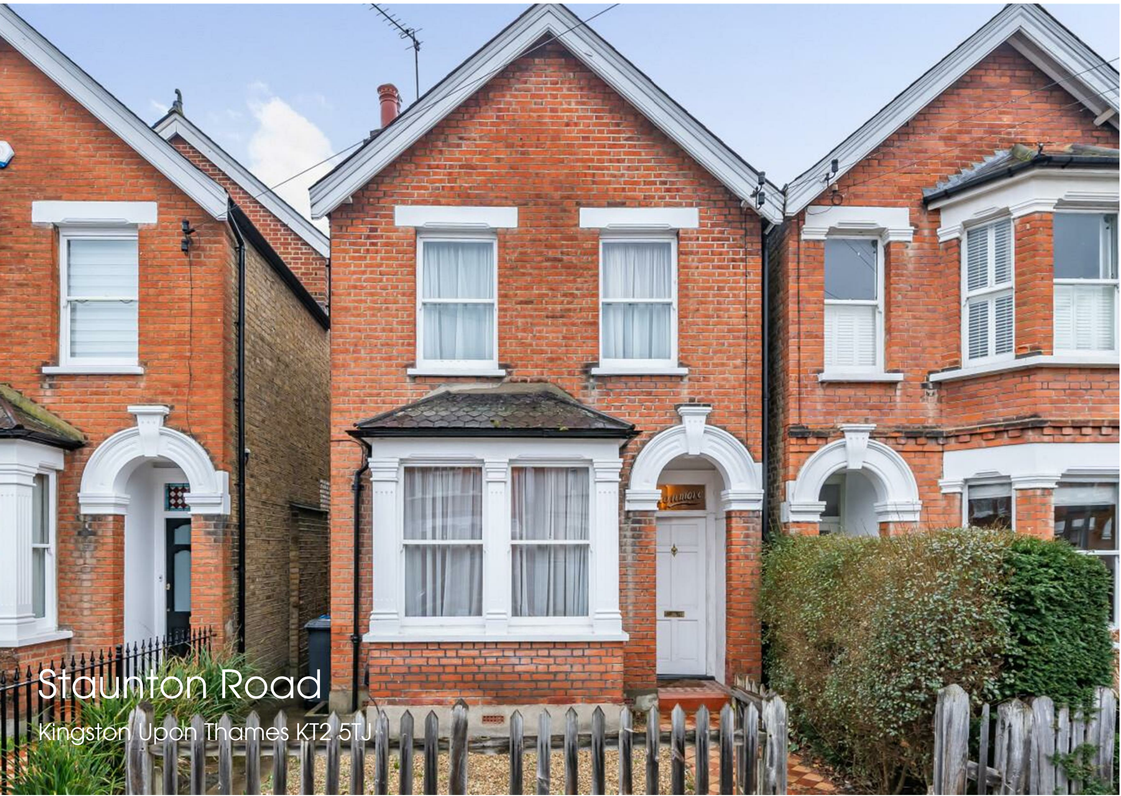
Staunton Road Kingston Upon Thames KT2 5TJ